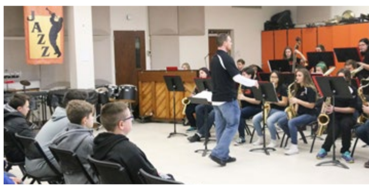
Mexico High School jazz band members, right, play a few tunes for Mexico Middle School 8th graders, left, during the annual electives presentation at the high school.